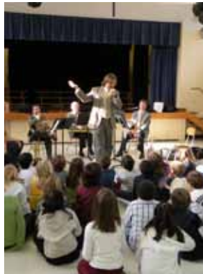
A Princeton Symphony Orchestra BRAVO! program Brass ensemble performance at a local school.

— BRAVO! Program. PSO's BRAVO! program enriches music education in local schools by providing a comprehensive and sustained introduction to the symphony orchestra, integrated within a school's regular music curriculum. Founded in 1989, the PSO performs a seven concert series at Richardson Auditorium on the campus of Princeton University (Princeton, New Jersey) and is regarded as one of the region's finest musical