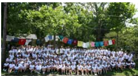
Anchor House Ride for Runaways, July 11-18, 2009. Oswego, NY to Trenton, NJ

Anchor House – 31st Annual Anchor House “Ride for Runaways.” On July 11, 2009, 200+ riders and support crew departed for a grueling, one week, 500 mile marathon ride, which began in Oswego, NY and ended in Trenton, NJ. The ride raised money to keep the doors of Anchor House open. Established in 1978, Anchor House, Inc. is a multi-service agency for runaway, homeless, abused, and at-risk youth and their families. It has served more than 20,000 youth and families since opening its doors. http://www.anchorhousenj.org/