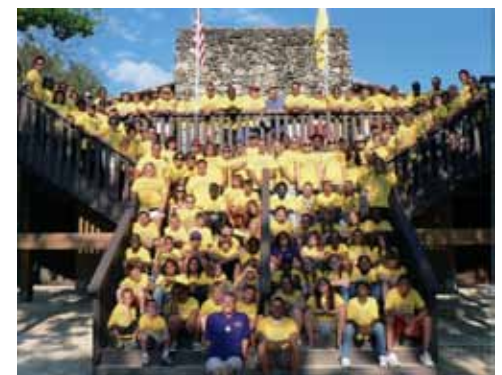
Attendees at the 2009 Missouri Children's Burn Camp sponsored by Burns Recovered Support Group.

Burns Recovered Support Group – Missouri Children's Burn Camp (MCBC). Founded in 1997, MCBC is a week-long sleep away camp for burn-injured children, ages 6-17. The majority of children come from low income families and are residents of Illinois, Kansas and Missouri and all were hospitalized in