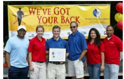
The Spinal Research Foundation (SRF) physicians and the race directors from PA and DC "We've Got Your Back" Race/Walks

2009 "We've Got Your Back" Race/Walk. The Race/Walk is a 4-mile race and 2-mile fun walk to increase spinal health awareness. Almost 250 people participated, raising approximately $21,000. The proceeds directly supported programs of awareness, education, advocacy and research for spinal disease. The Spinal Research Foundation was established in 2002 to improve spinal health care through research