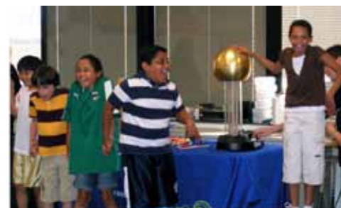
The Electricity and Magnetism workshop at the Village School presented by the Liberty Science Center.